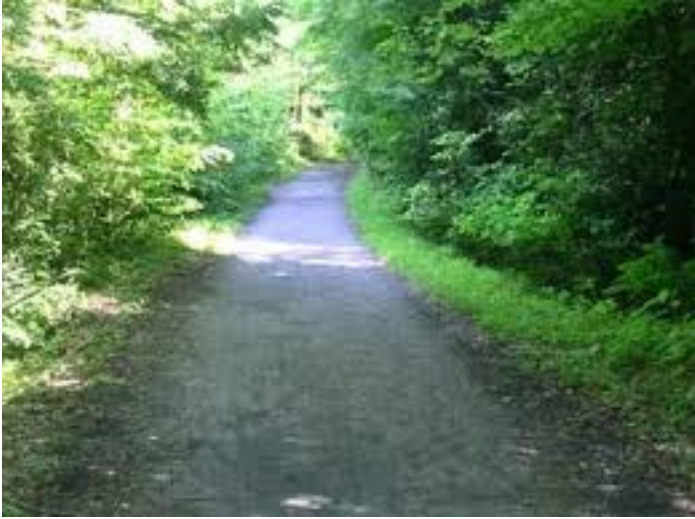
Figure 6. The Lush Flora alongside the Virginia Creeper Trail