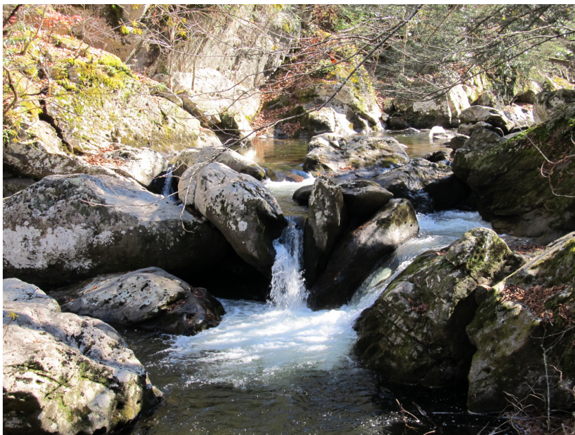
Figure 5. A view along the Virginia Creeper Trail in the Jefferson National Forest