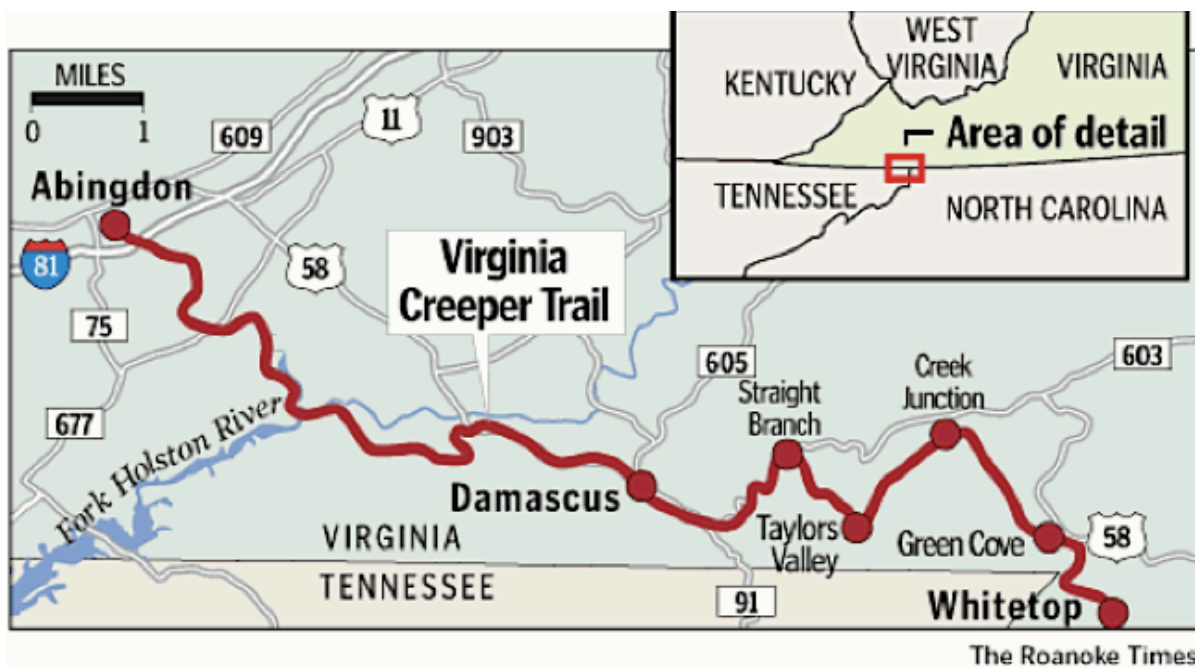
Figure 3. Virginia Creeper Trail with Damascus in the middle.