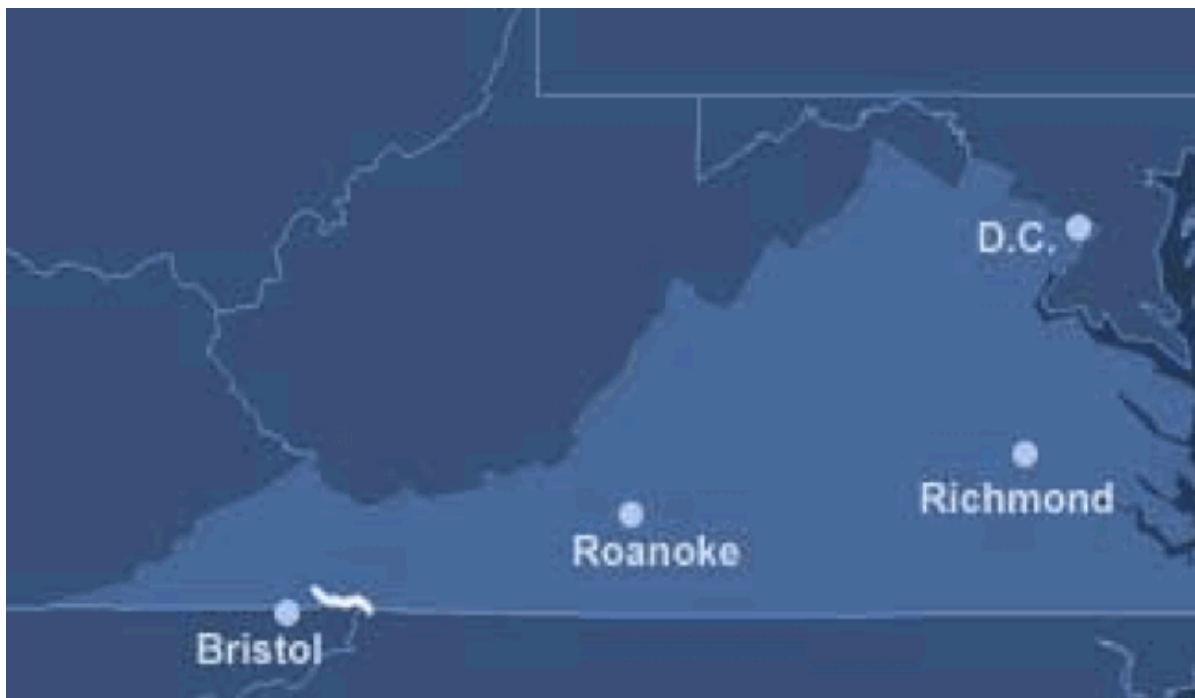
Figure 2. Virginia and the Virginia Creeper Trail.